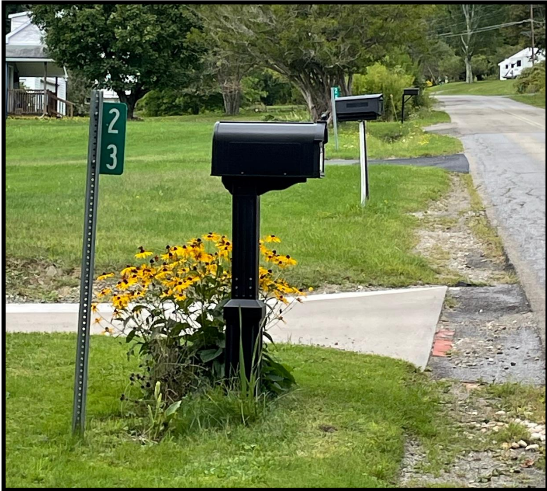
Figure 6: Example of Reflective Address Placard placed at Driveway leading to a residential structure