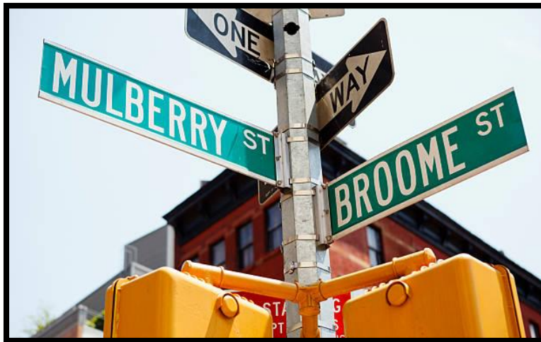
Figure 5: Example of Road Signs that include cross streets at an Intersection