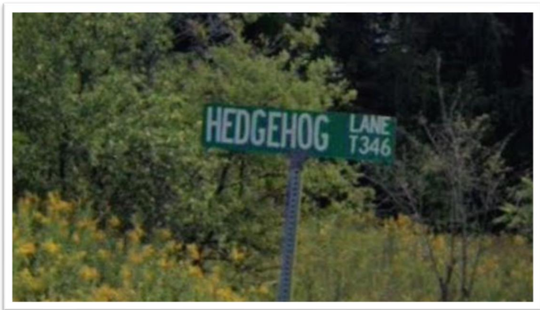
Figure 3: Township Road sign with a TR number present