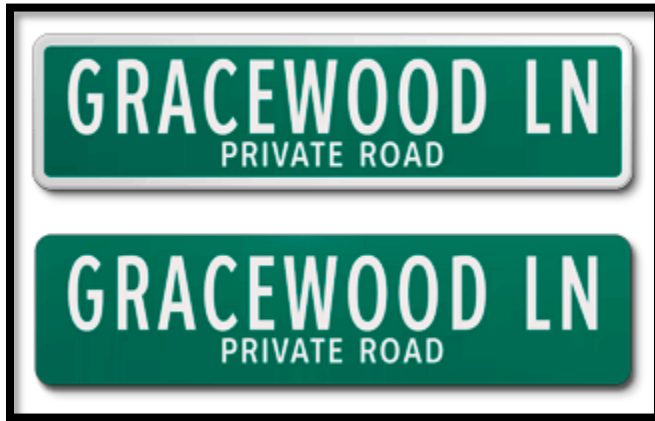
Figure 4: Road sign for Private Road example

included on the sign, above or below the road name in smaller lettering, not impeding the visibility and legibility of the road name. (Figure 4)